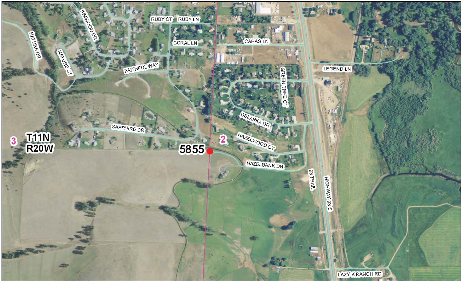
Map of Area

To Reach: 2wd access through private property.