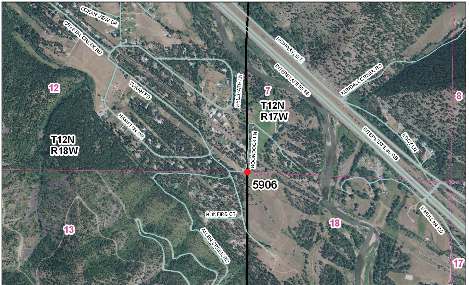
Map of Area

To Reach: 2wd access to within 30 feet of the monument.