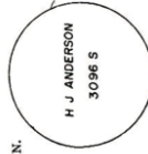
DIAGRAM OF CORNER: