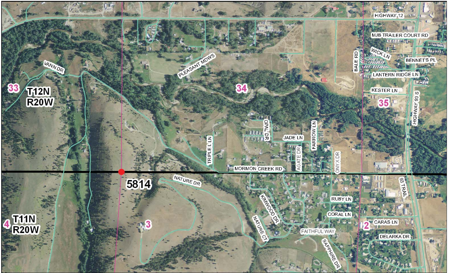
Map of Area

To Reach: 2wd access to within 100 feet of the monument with permission from landowner.