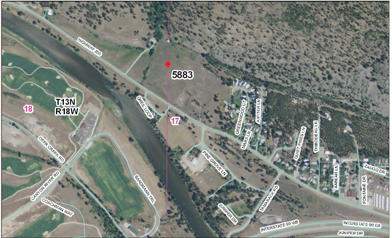
Map of Area

To Reach: 2wd access through a pasture with permission.