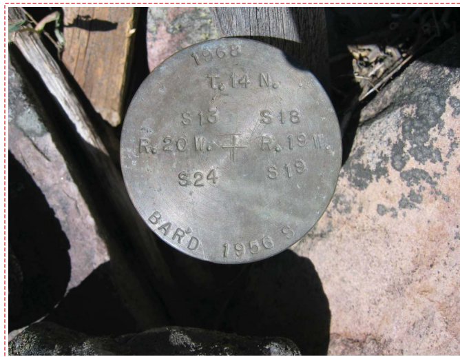
Photo Looking East