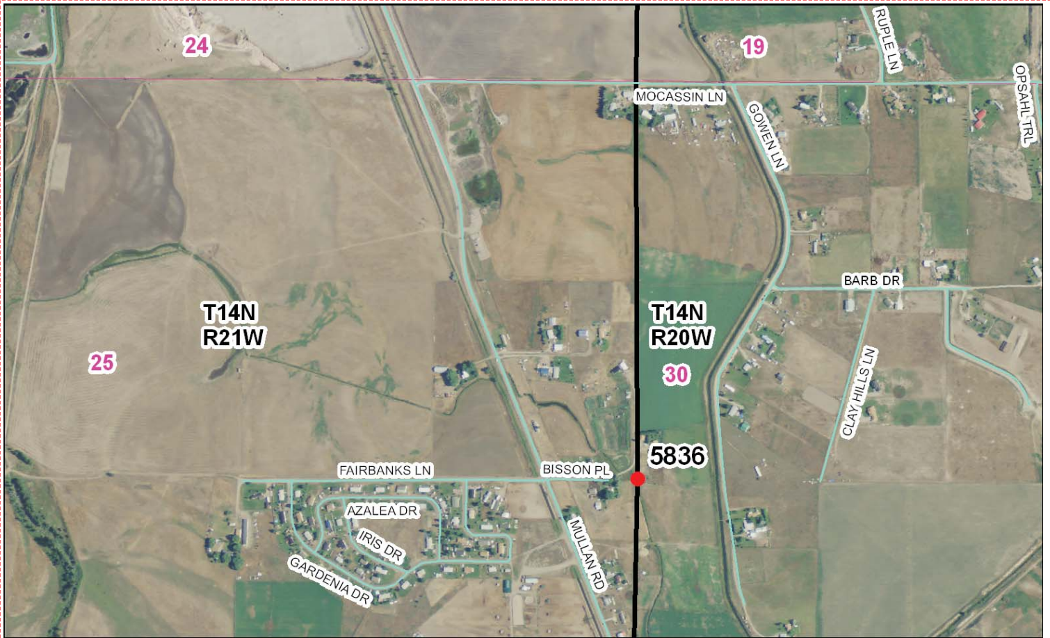
Map of Area