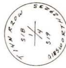
DIAGRAM OF CORNER:

SKETCH, WITH COURSE AND DISTANCE TO ADJACENT CORNERS IF DETERMINED IN THIS SURVEY. (MAY SKETCH OR PASTE REPRODUCTION ON REVERSE SIDE.)