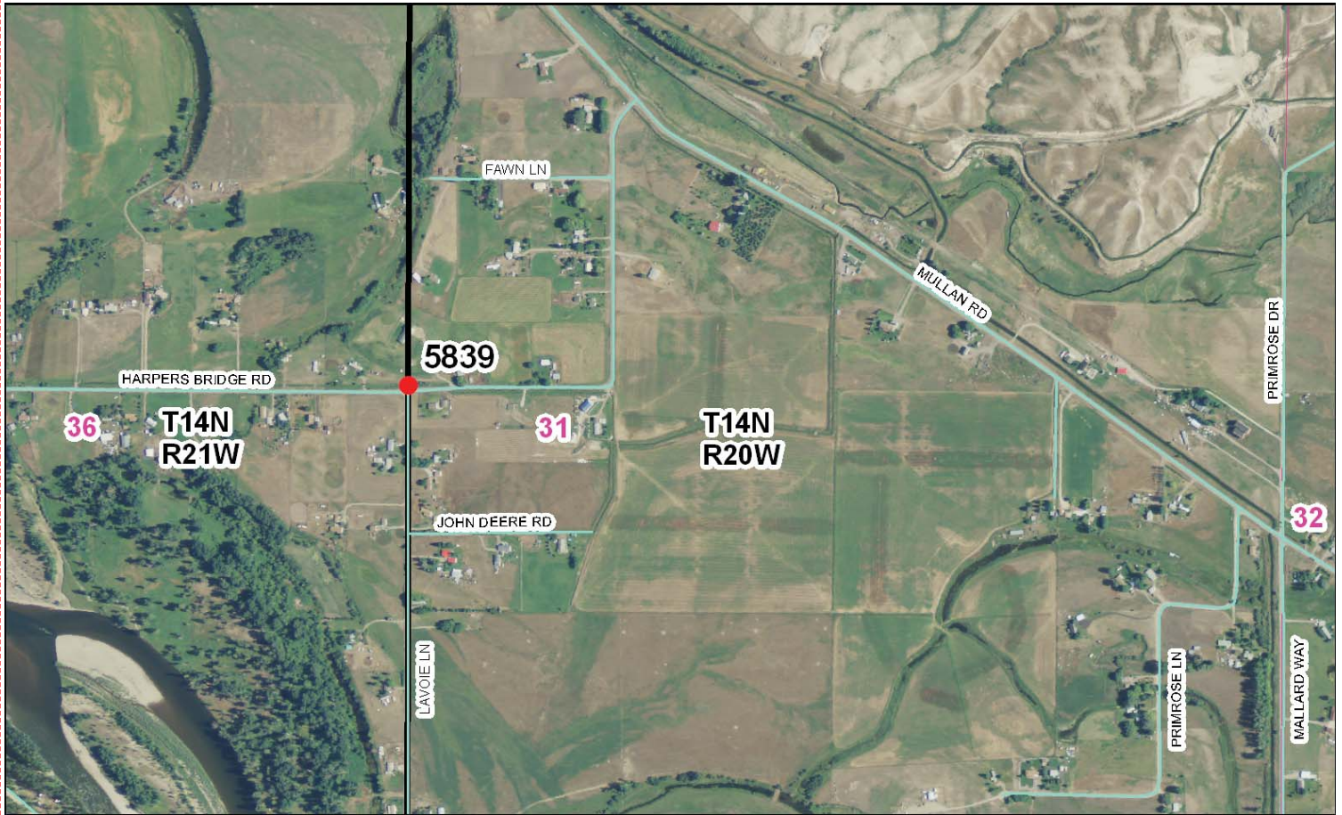
Map of Area