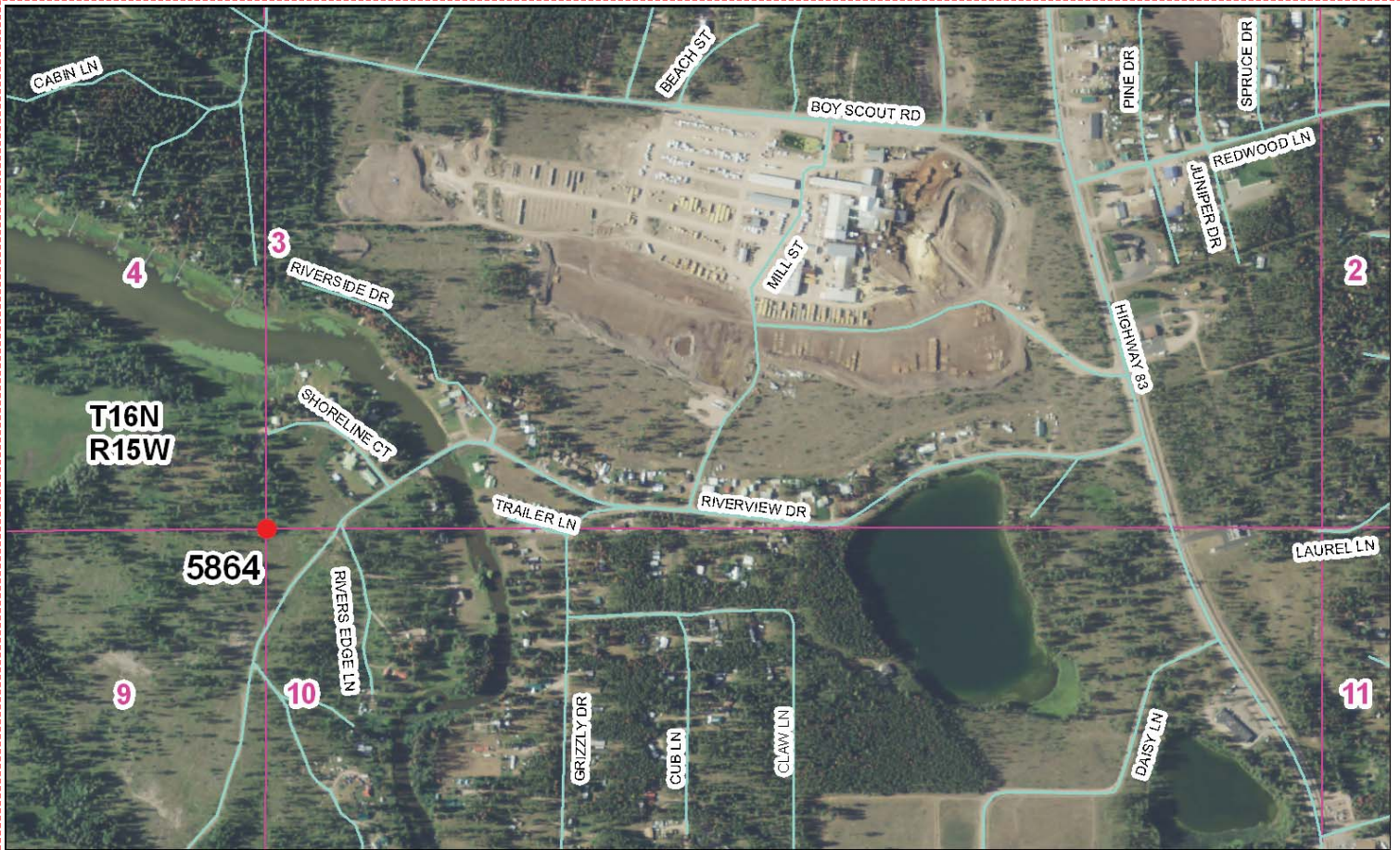
Map of Area

To Reach: 2wd access, 300 foot walk from road to monument.