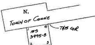
DIAGRAM OF CORNER:

SEC 25, T9S, R14E PARK COUNTY, MT. = Corner recorded on the sheet