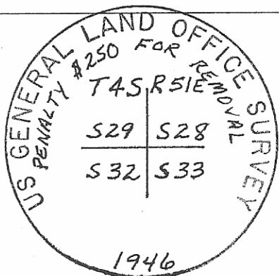
SKETCH OF CORNER