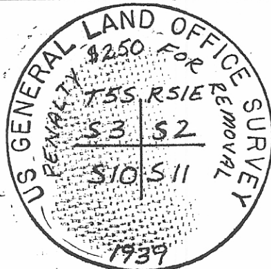
SKETCH OF CORNER