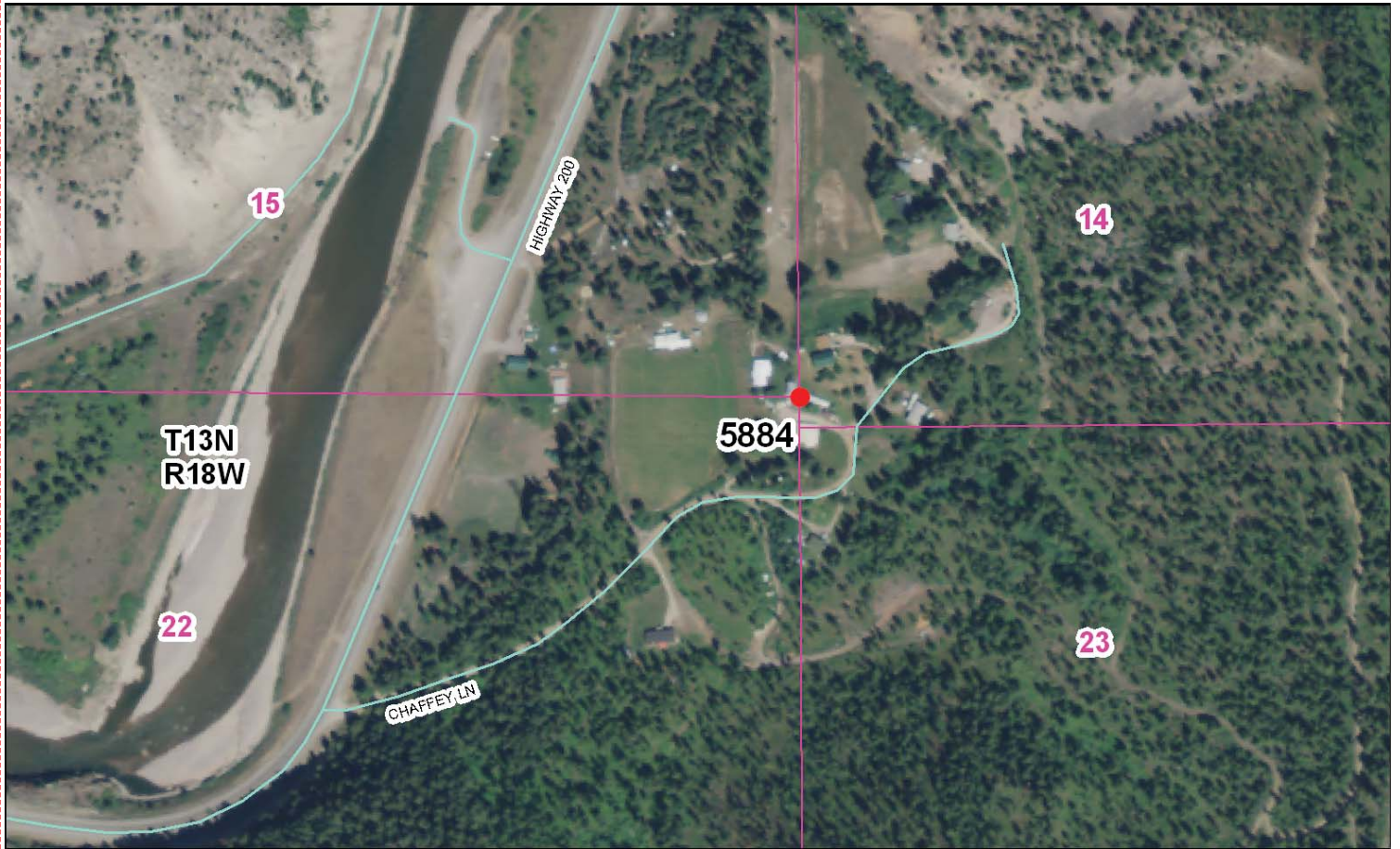
Map of Area