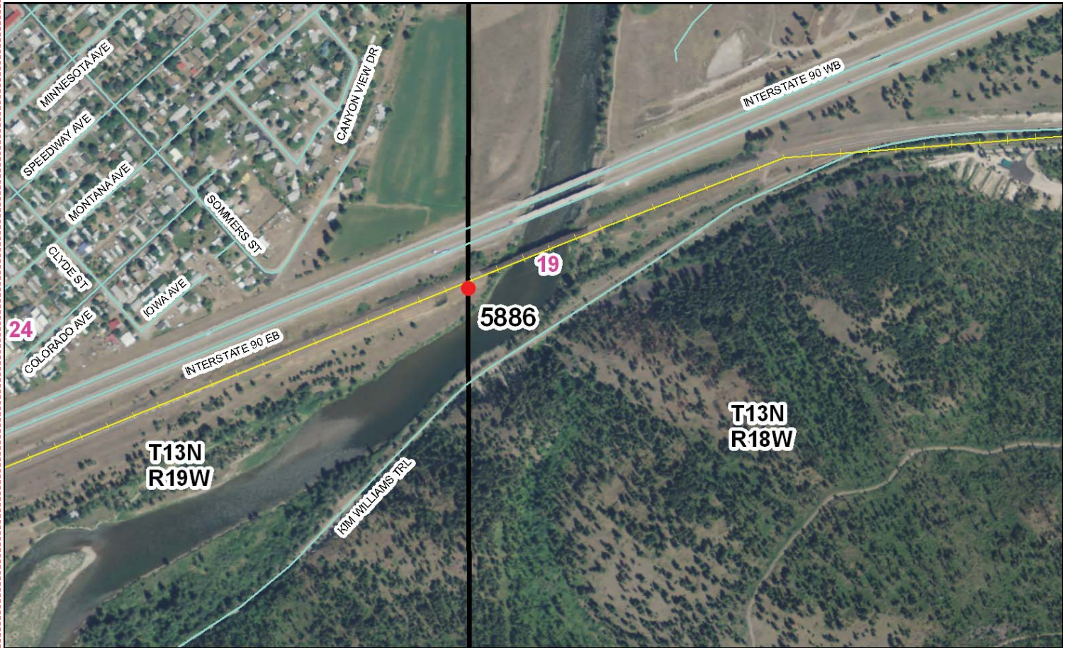
Map of Area

To Reach: 2wd access. Pull off eastbound lane of I-90, on the west side of the first bridge crossing the Clark Fork River, east of Missoula. Walk 200 feet to the south side of the rail road tracks, monument is west of the rail road bridge, halfway down the fill slope.