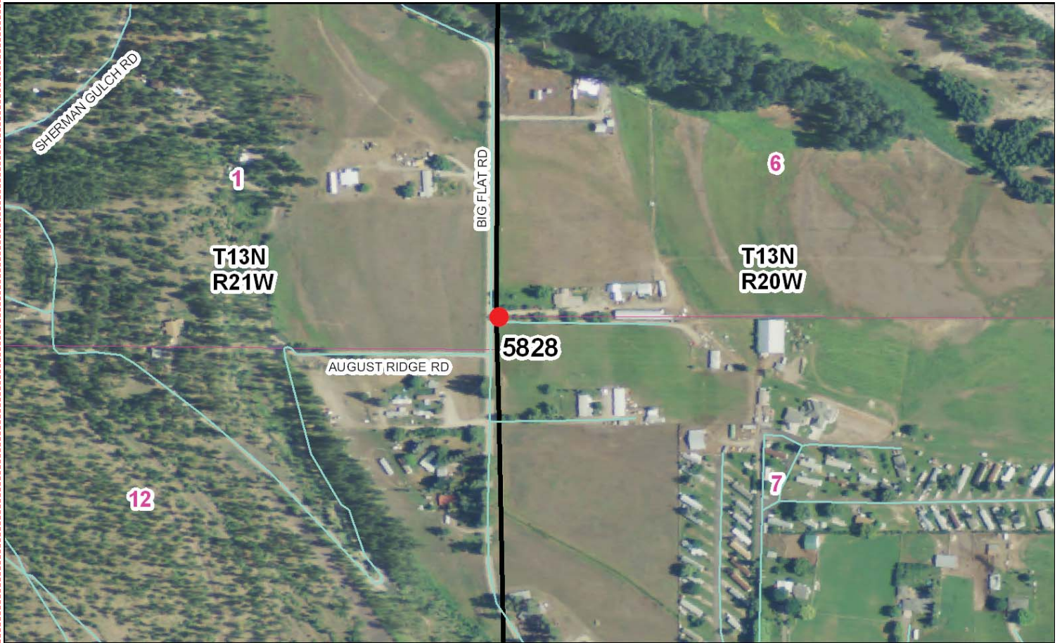
Map of Area

To Reach: 2wd, monument is east of Big Flat Road, at the west end of two driveways.