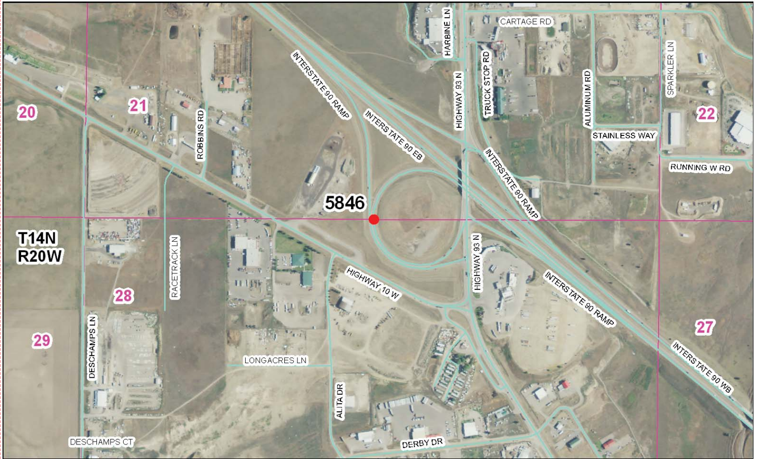
Map of Area

To Reach: 2wd access, monument falls on edge of exit ramp.