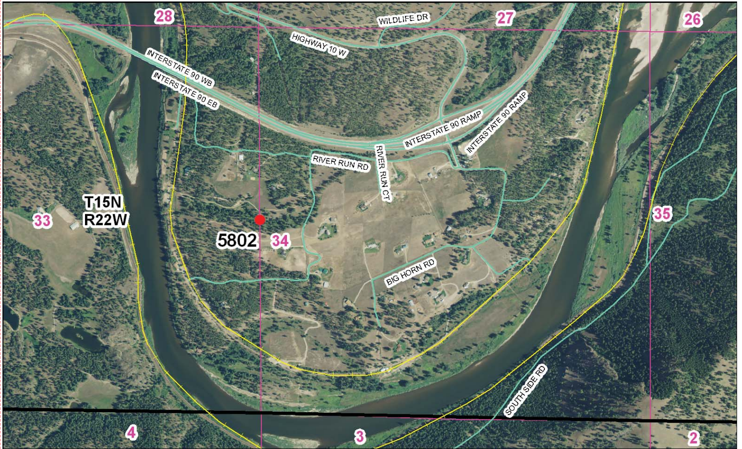
Map of Area

To Reach: 2wd access to within 100 feet of the monument.