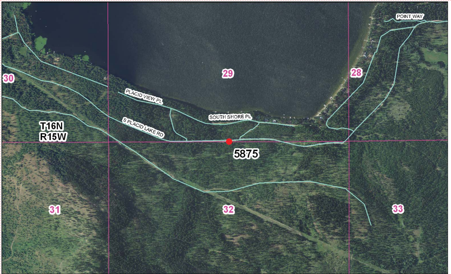
Map of Area