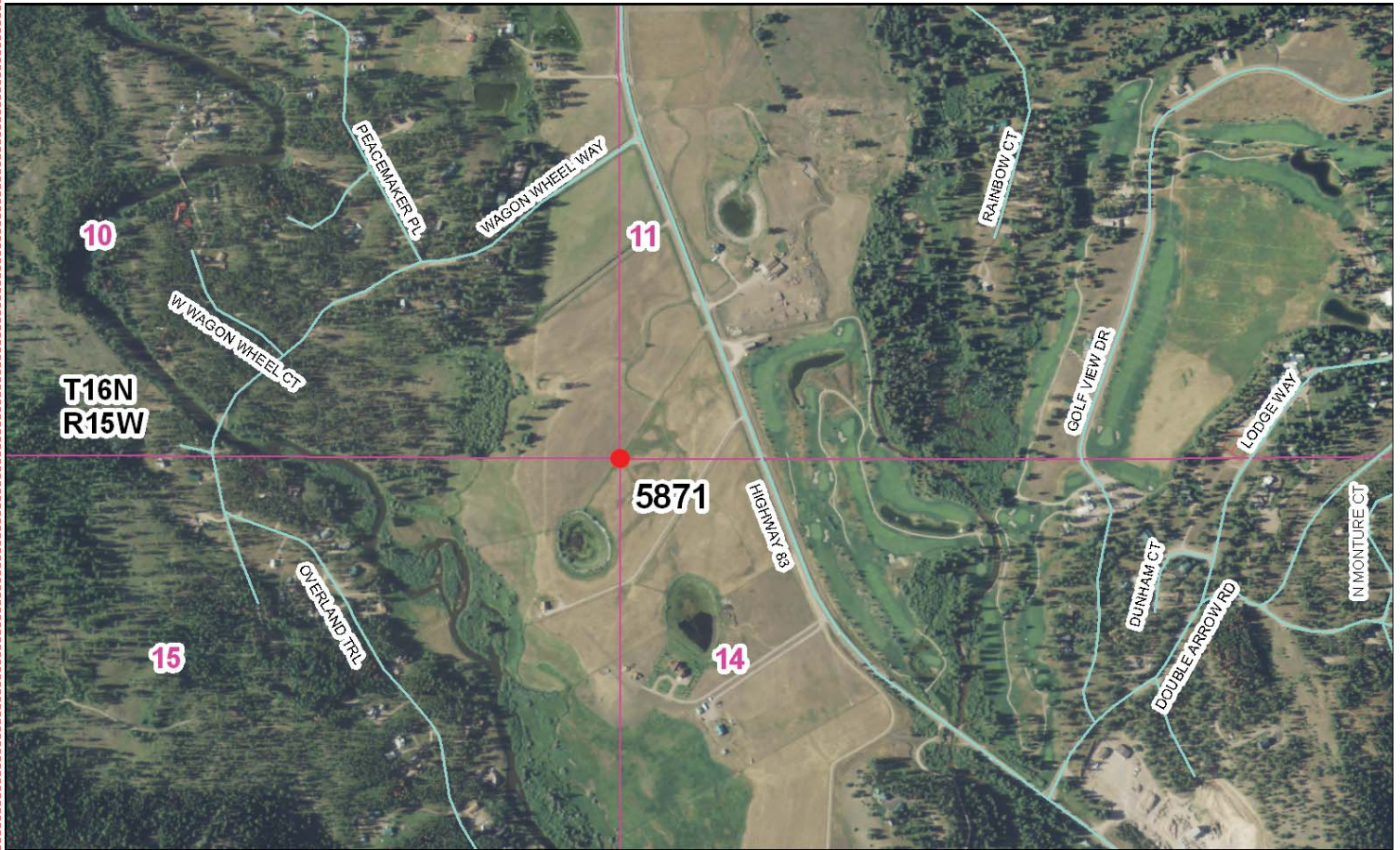
Map of Area

To Reach: 2wd access with permission through private field.