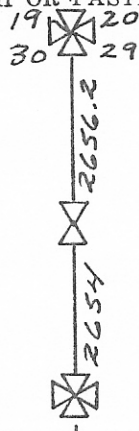
DIAGRAM OF CORNER: