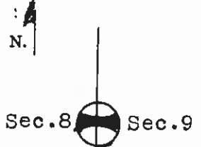
DIAGRAM OF CORNER: