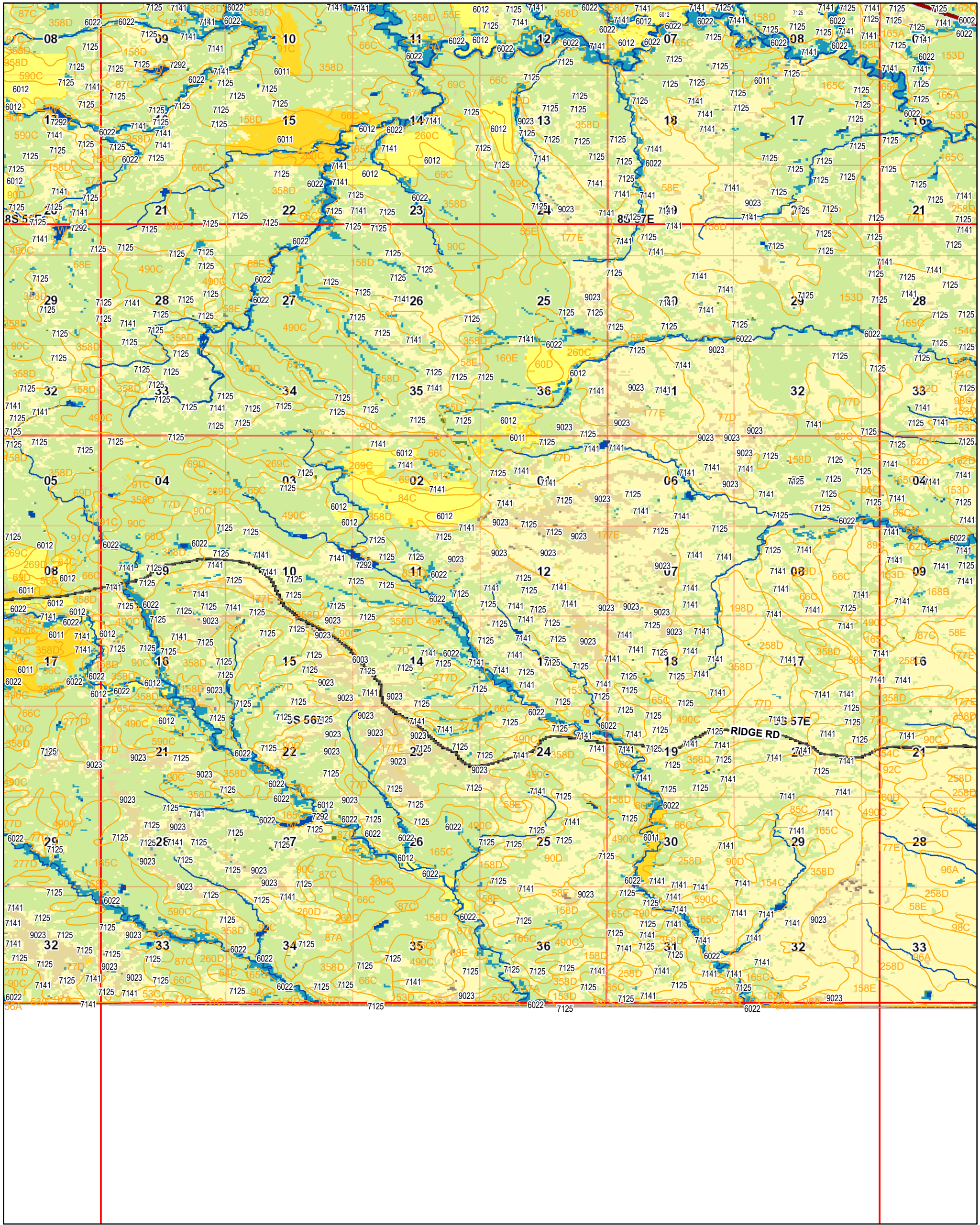
45104a7 - Hammond SE